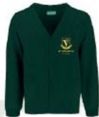
Bottle Green Cardigan