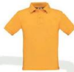
Gold Plain Polo