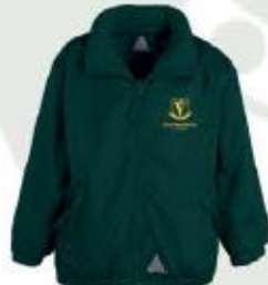
Bottle Green Reversible Jacket