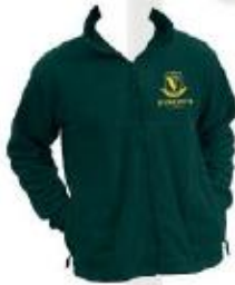
Bottle Green Fleece