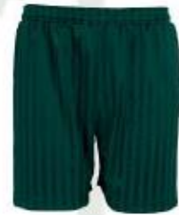
Bottle Green Gym Shorts