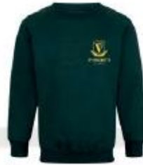
Bottle Green Round Neck Sweater