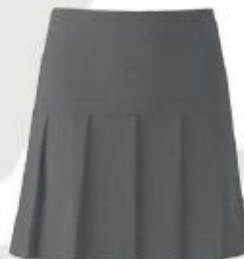
Mid Grey Pleated Skirt