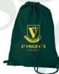
Bottle Green Gym Bag Embroidery