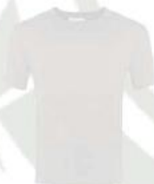
PE Plain White T-Shirt